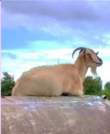
Tutukinoa HoneyBee NZAGA Reg. No. 201