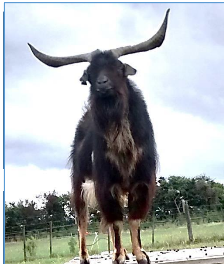
Tutukinoa Dobby, 2/2/2015