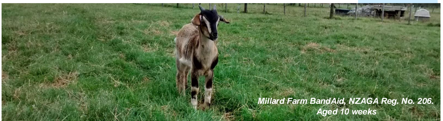
Millard Farm BandAid, NZAGA Reg. No. 206. Aged 10 weeks